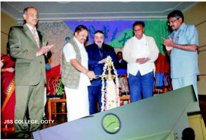
JSS COLLEGE, OOTY