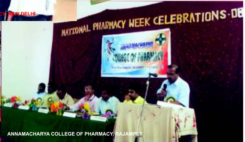
ANNAMACHARYA COLLEGE OF PHARMACY, RAJAMPET