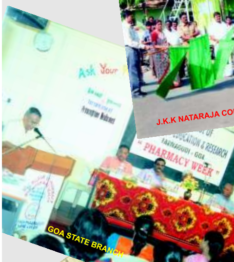
GOA STATE BRANCH