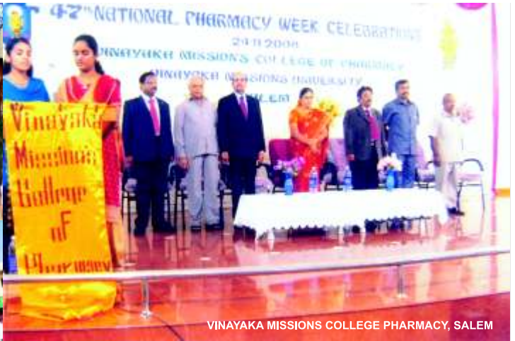
VINAYAKA MISSIONS COLLEGE PHARMACY, SALEM