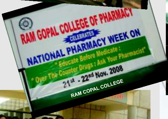
RAM COPAL COLLEGE