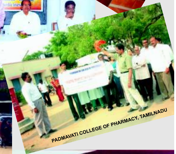
PADMAVATI COLLEGE OF PHARMACY, TAMILNADU