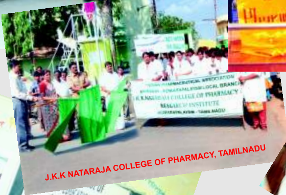
J.K.K. NATARAJA COLLEGE OF PHARMACY, TAMILNADU