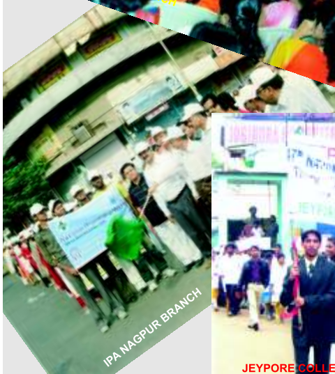
IPA NAGPUR BRANCH