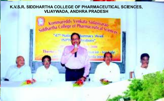
K.V.S.R. SIDDHARTHA COLLEGE OF PHARMACEUTICAL SCIENCES, VIJAYWADA, ANDHRA PRADESH