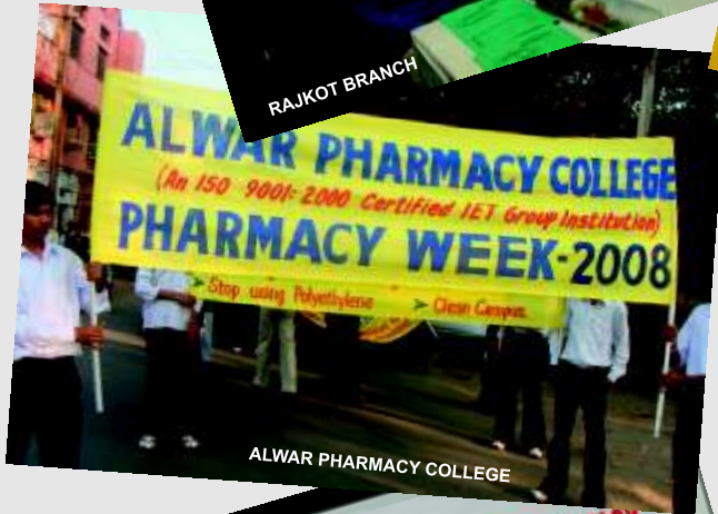
ALWAR PHARMACY COLLEGE