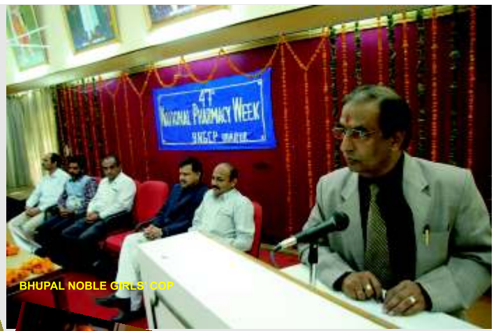
BHUPAL NOBLE GIRLS' COP