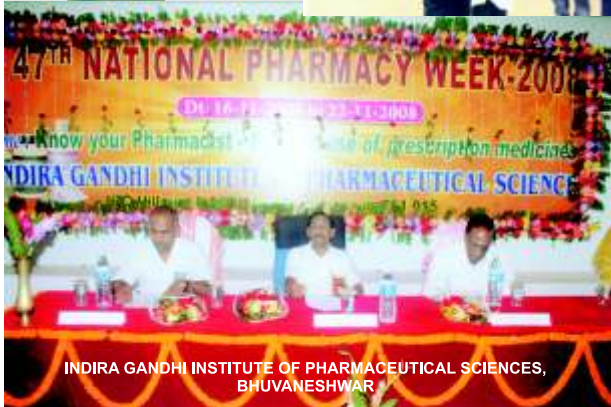
INDIRA GANDHI INSTITUTE OF PHARMACEUTICAL SCIENCES, BHUVANESHWAR