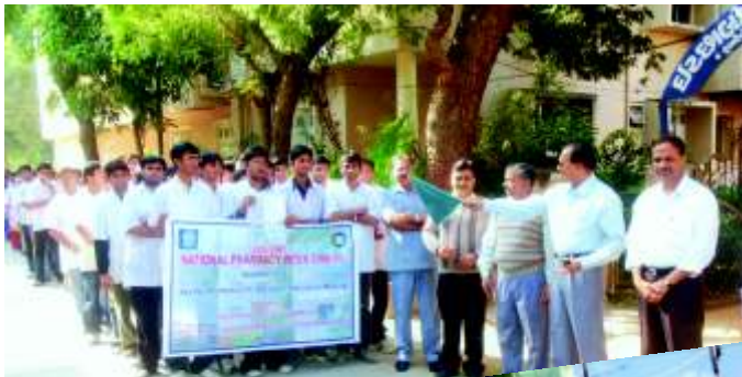
MODASA STATE BRANCH