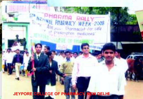
JEYPORE COLLEGE OF PHARMACY, NEW DELHI