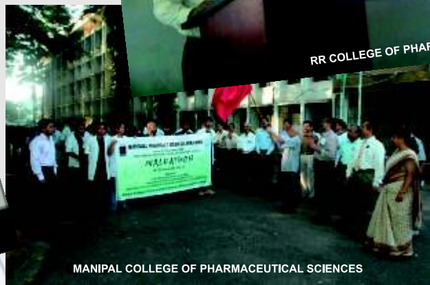
MANIPAL COLLEGE OF PHARMACEUTICAL SCIENCES