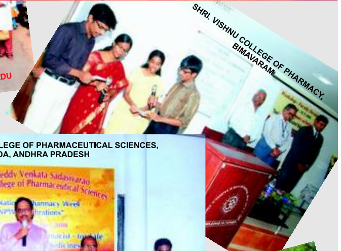
SHRI. VISHNU COLLEGE OF PHARMACY, BIMAARAM